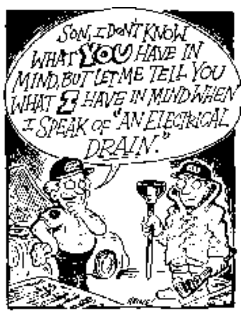
© 1991 Mighty Distributing System of America, Inc.

© 1991 Mighty Distributing System of America, Inc. 50 Technology Park, Atlanta, GA 30092 (800) 829-3900